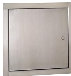
MODEL TMS STAINLESS STEEL